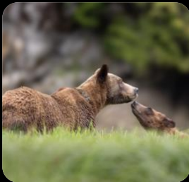
DAY 2 22 June – B/L/D