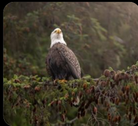
DAY 4 24 June – B/L/D