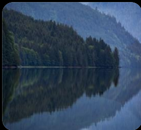
DAY 1 21 June – L/D

Please Note: Due to the early meeting time on the first day, you must arrive in Prince Rupert prior to Day 1 of your expedition.