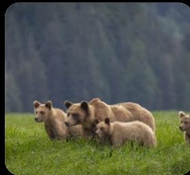
DAY 5 25 June - B