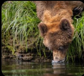
DAY 3 23 June – B/L/D